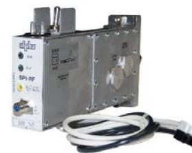
Service Power Inserter (SPI-RF) with RF port