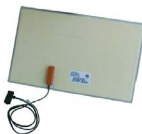
Battery Heater Mat (BHM)